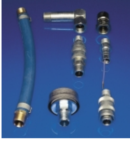
Family of Coaxial-Components

Form 442882 © Copyright 1999 Printed in U.S.A.